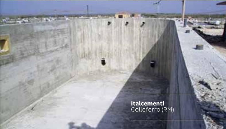
Italcementi Colleferro (RM)