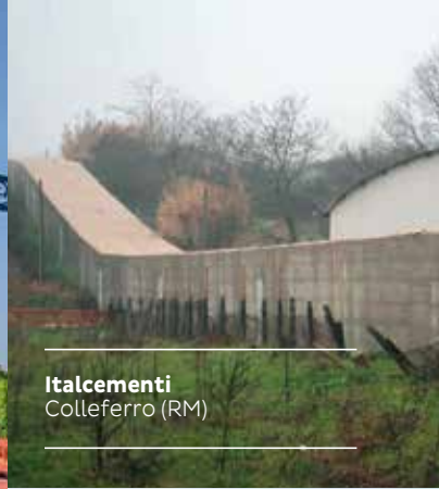
Italcementi Colleferro (RM)