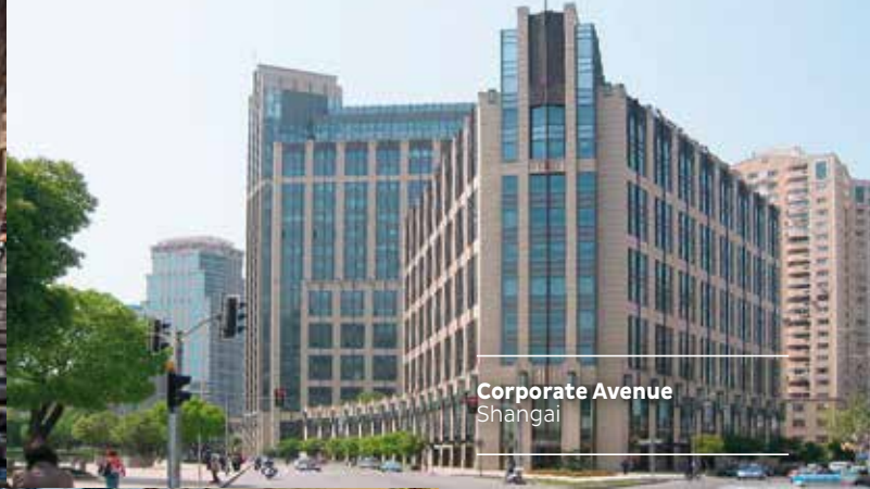
Corporate Avenue Shanghai