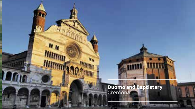
Duomo and Baptistery Cremona