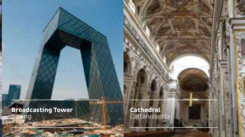
Broadcasting Tower Beijing