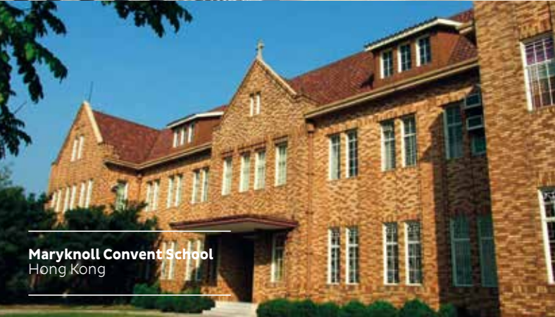
Maryknoll Convent School Hong Kong