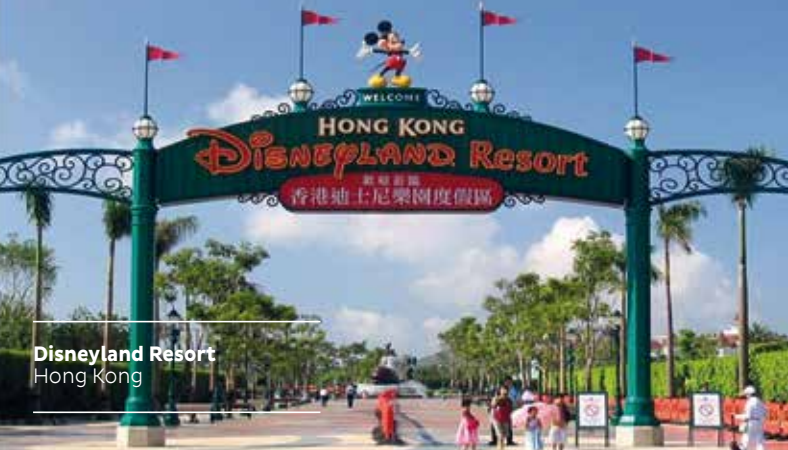
Disneyland Resort Hong Kong