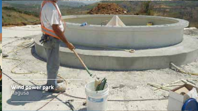
Wind power park Ragusa