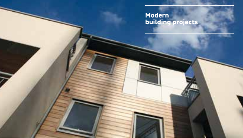
Modern building projects