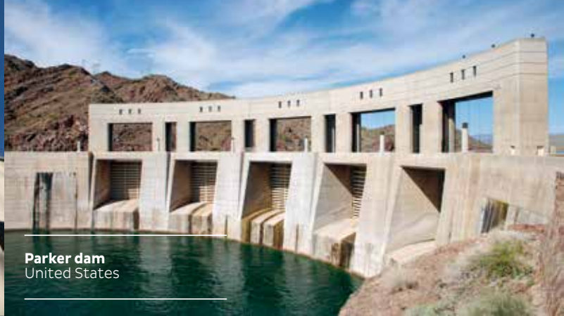
Parker dam United States