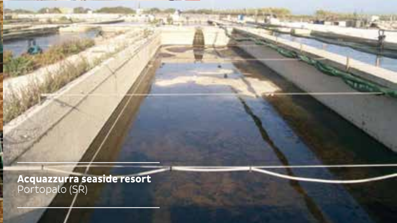
Acquazzurra seaside resort Portopalo (SR)