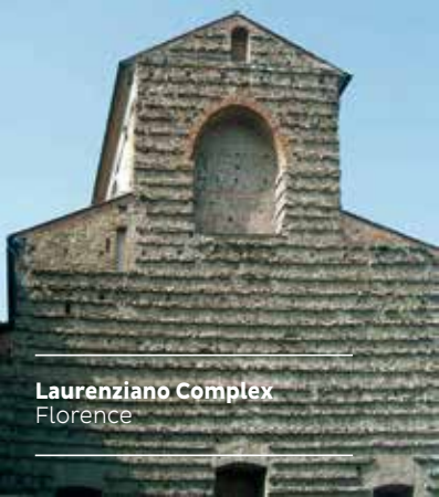
Laurenziano Complex Florence