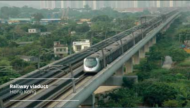
Railway viaduct Hong Kong