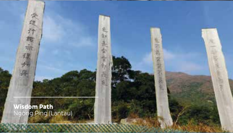
Wisdom Path Ngong Ping (Lantau)