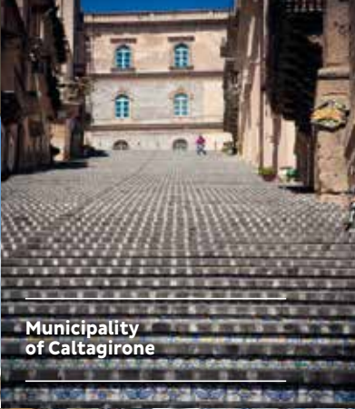
Municipality of Caltagirone