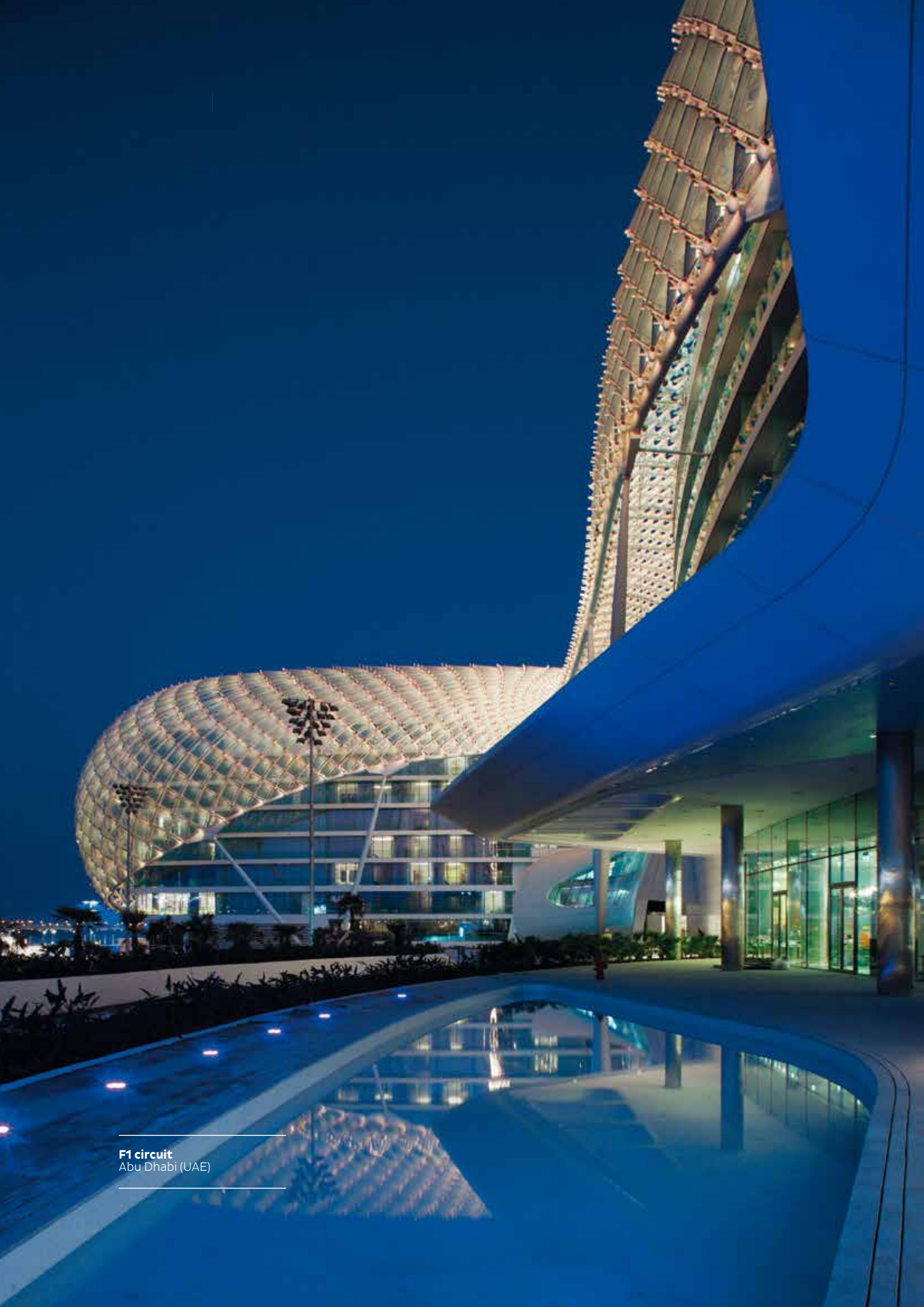
F1 circuit Abu Dhabi (UAE)